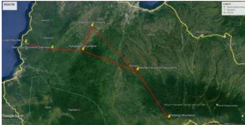
Figure 1. Route Used by the NPA in Manticao

When it comes to their camps, they did not stay in one place. They transferred from one camp to another. They usually stationed their camp in the deep forest (INM19).